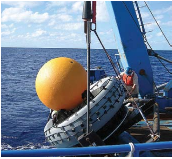
DEPLOYMENT OF HYDROPHONE AT HYDROACOUSTIC STATION 11, WAKE ISLAND, USA