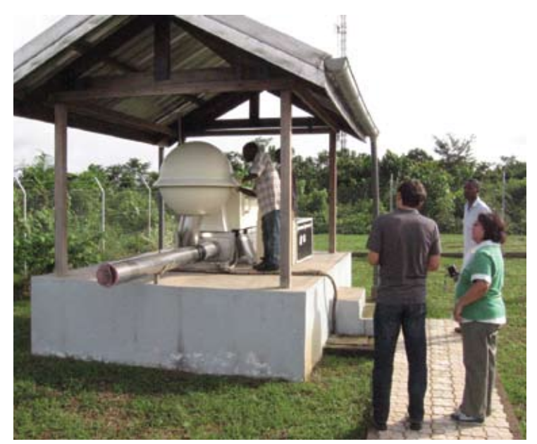
RADIONUCLIDE STATION 13, EDEA, CAMEROON