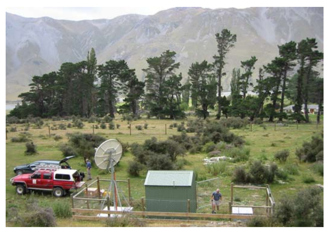
AUXILIARY SEISMIC STATION 69, RATA PEAKS, NEW ZEALAND