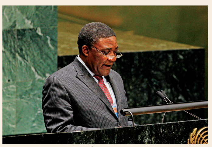
AMBASSADOR MICHEL TOMMO MONTHÉ OF CAMEROON ADDRESSING THE 2010 NPT REVIEW CONFERENCE ON BEHALF OF THE AFRICAN GROUP.