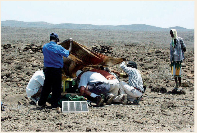
INFRASOUND STATION IS19 IN DJIBOUTI, DJIBOUTI.

nuclear weapons programme. All nuclear devices were destroyed. Shortly after in 1991, South Africa acceded to the NPT as a non-nuclear weapon State.