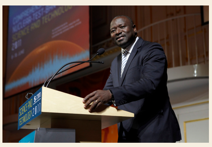
DIRECTOR OF THE CTBTO'S INTERNATIONAL DATA CENTRE, LASSINA ZERBO, WAS ALSO PROJECT EXECUTIVE OF THE 2011 SCIENCE AND TECHNOLOGY CONFERENCE IN VIENNA