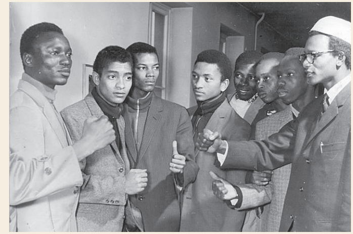
STUDENTS FROM MALI IN LEIPZIG, THEN EAST GERMANY, PROTESTING AGAINST THE FIRST FRENCH NUCLEAR TEST ON 13 FEBRUARY 1960.

re-affirmed by the African Nuclear-Weapon-Free Zone Treaty (Pelindaba Treaty) when it opened for signature in 1996. The creation of the African Union in July 2002 further strengthened Africa's commitment to regional and international peace and stability. African leaders recognized that security is a prerequisite for sustainable economic development and human welfare.