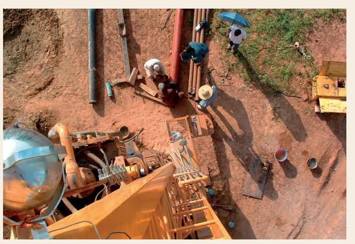
RADIONUCLIDE STATION RN43 IN NOUAKCHOTT, MAURITANIA