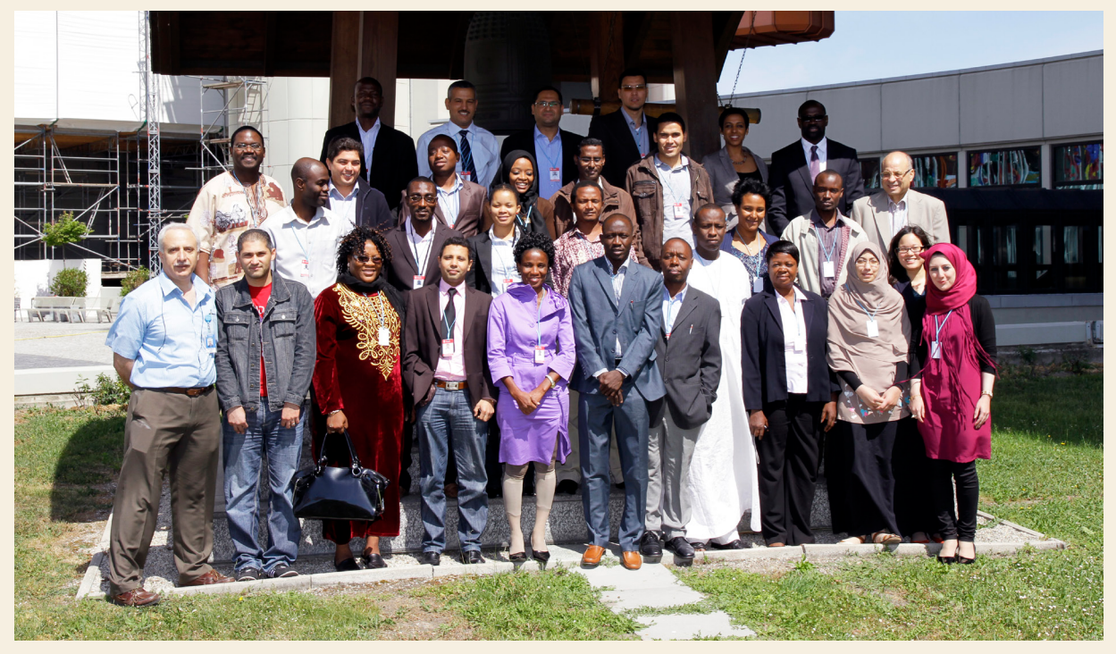
TRAINING FOR NATIONAL DATA CENTRE STAFF FROM AFRICA AND THE MIDDLE EAST IN VIENNA IN MAY 2012.

States hosting monitioring facilities. Once complete, there will be 38 monitoring facilities located in 24 African States. Of these stations, over 25 are already up and running. South Africa hosts five monitoring facilities – more than any other country in Africa. In addition to hosting stations, Cameroon, Cape Verde, Central African Republic, Kenya, Mauritania, Namibia, Niger, Senegal, South Africa, Tanzania, Tunisia and Zambia have also concluded Facility Agreements with the CTBTO to regulate all related legal, technical and logistical aspects.