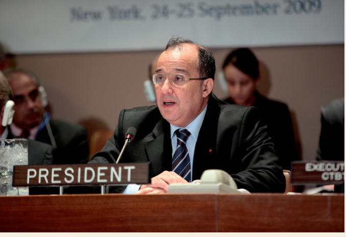
MOROCCAN FOREIGN MINISTER TAIB FASSI FIHRI AT THE 2009 CONFERENCE TO FACILITATE THE ENTRY INTO FORCE OF THE CTBT IN NEW YORK.

'The African Group is convinced that an early entry into force of the CTBT to enforce a comprehensive ban on all forms of nuclear test explosions is a concrete and meaningful step in the realization of a systematic process to achieve nuclear disarmament."