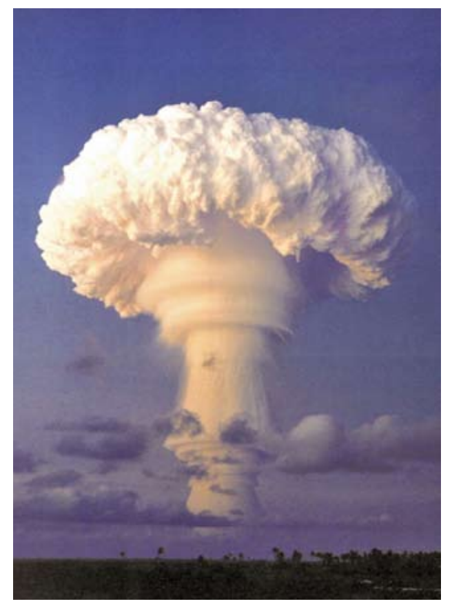
210 KT ATMOSPHERIC NUCLEAR TEST EXPLOSION 'TRUCKEE' CONDUCTED BY THE UNITED STATES ON 9 JUNE 1962 AT 15:37 GMT, 10 MILES SOUTH OF CHRISTMAS ISLAND, A NON SELF-GOVERNING TERRITORY OF AUSTRALIA.