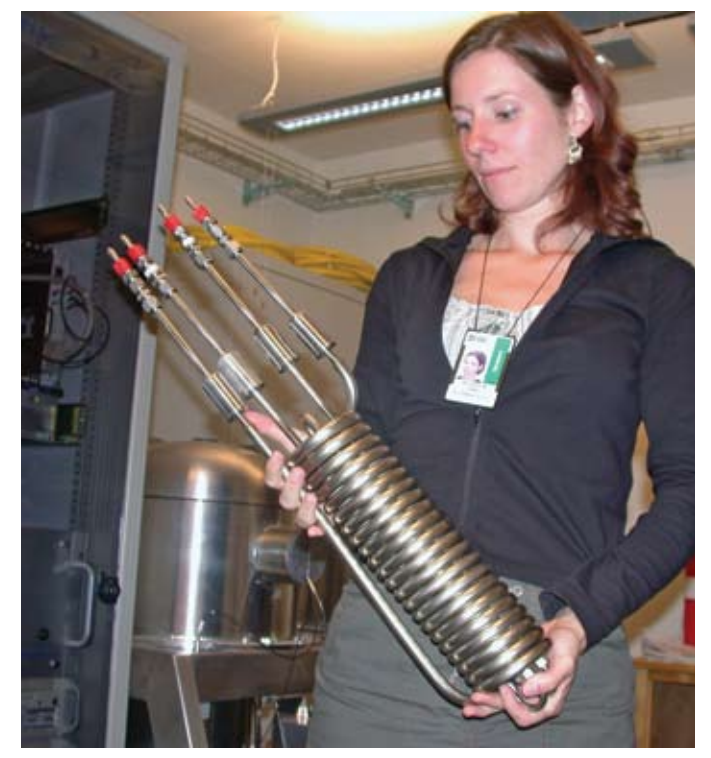
A DETACHED HELICAL XENON GAS ADSORPTION COLUMN WHICH FORMS PART OF THE COMPLETE SAMPLE PURIFICATION SYSTEM

another Member State institution to establish the capability for high-sensitivity laboratory measurements of samples collected on-site. This will also allow inter-comparison measurements with independent methods, an approach which has proven useful in the development of RNG analysis for the International Monitoring System.