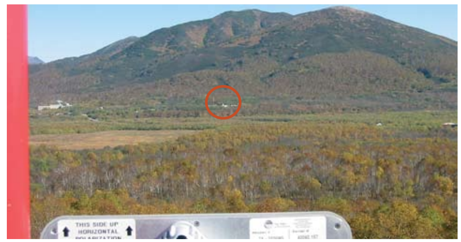
PICTURE TAKEN FROM THE COMMUNICATION TOWER IN RADIO LINE-OF-SIGHT TO THE CENTRAL RECORDING FACILITY (CIRCLED IN RED), KAMCHATKA, RUSSIAN FEDERATION

closing of the only road and the evacuation of more than 4000 residents in the area.