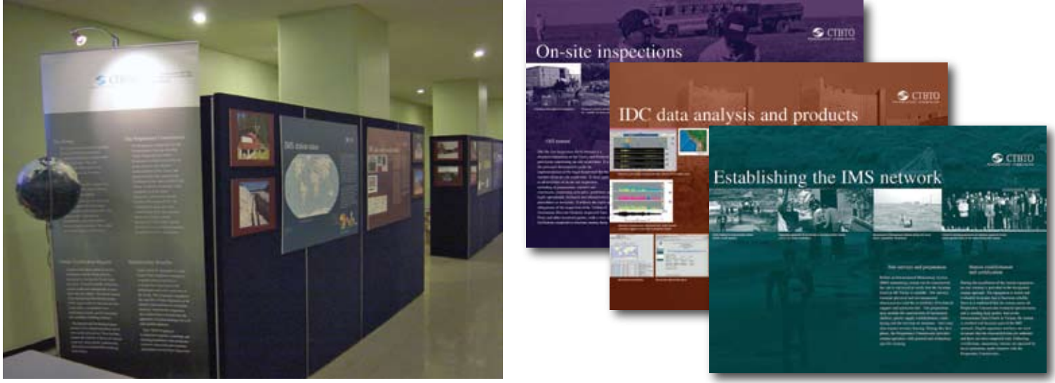
A CTBTO EXHIBITION CALLED 'CTBT - A GLOBAL VERIFICATION REGIME' PREPARED BY PUBLIC INFORMATION WAS DISPLAYED ON THE OCCASION OF THE 2005 CONFERENCE ON FACILITATING THE ENTRY INTO FORCE OF THE COMPREHENSIVE NUCLEAR-TEST-BAN TREATY IN NEW YORK, 21-23 SEPTEMBER 2005. ON ELEVEN PANELS, SIX FREE-STANDING SCREENS AND 24 PHOTOGRAPHS, THE EXHIBITION DETAILED HOW THE GLOBAL VERIFICATION REGIME WILL BE USED TO MONITOR COMPLIANCE WITH THE CTBT. A GLOBE DEPICTING ALL INTERNATIONAL MONITORING SYSTEM FACILITIES WAS ALSO PART OF THE EXHIBITION.