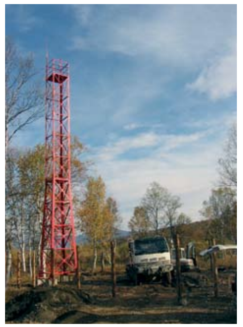
ONE OF THE 18 METRES TALL COMMUNICATIONS TOWERS INSTALLED AT IS44 AND PS36, KAMCHATKA, RUSSIAN FEDERATION

The two co-located arrays required massive site preparation activities for the installation of the well-designed and built vaults, robust and modern radio antenna towers and state of the art central recording facilities. The site preparation