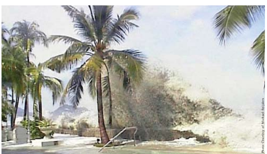
TSUNAMI HITTING THE COAST OF PHUKET, THAILAND, 26 DECEMBER 2004

Technically, the PTS could offer a number of special contributions to a tsunami warning effort. One would be the provision of data in near-real time from IMS seismological