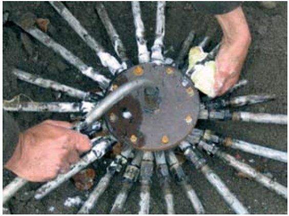
SEALING THE INFRASOUND PIPE ARRAY, IS44, KAMCHATKA, RUSSIAN FEDERATION