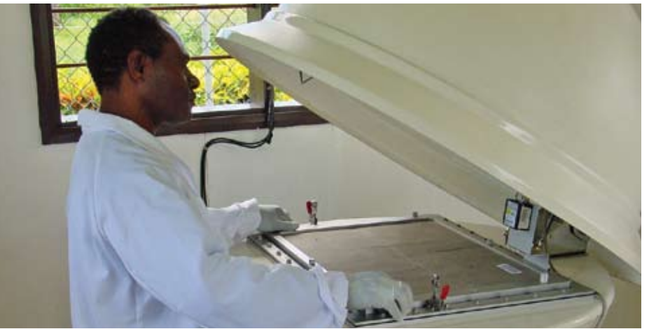
DAILY CHANGE OF FILTER IN THE AIR SAMPLER AT RN51, NEW HANOVER, PAPUA NEW GUINEA

services provided to the CTBTO by forecast centres and the Secretariat of WMO. These include in particular: