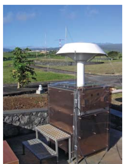
MANUAL STATION AIR SAMPLER AT RN29, RÉUNION, FRANCE

the earth's surface requires supplementary information on a number of factors, such as type, temperature and moisture of the soil, as they control the release of <sup>222</sup>Rn gas to the atmosphere. Suitable global datasets are needed to predict <sup>222</sup>Rn emissions which are generated by the decay of <sup>226</sup>Ra. However, global information on <sup>226</sup>Ra in the soil is incomplete and observations of