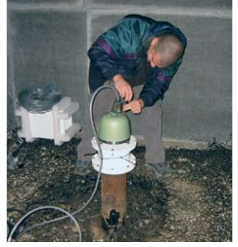
MEASUREMENTS INSIDE CENTRAL ARRAY ELEMENT PS36, KAMCHATKA, RUSSIAN FEDERATION

sending test data since 1 December, which are transmitted in near-real time first to the Russian National Data Centre in Dubna and then forwarded to the IMS laboratory in Vienna. All this would not have been possible without