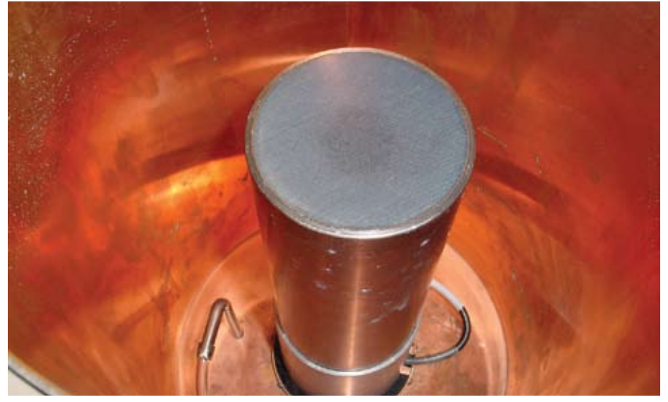
HIGH-PURITY GERMANIUM DETECTOR IN ITS LEAD SHIELD WITH AN INNER COPPER LINING

Techniques of measuring radionuclides need to be standardized and harmonized, observations need to be collected and