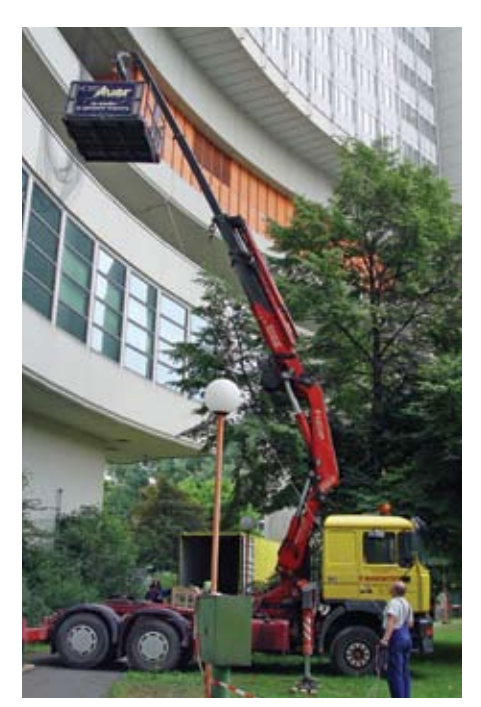
CRANE MOVING UNINTERRUPTABLE POWER SUPPLY TO THE NEW PTS COMPUTER CENTRE

Over 300 measuring points, registering person access, smoke, water leakage, temperature and humidity control systems, are positioned strategically to measure any anomalies in the centre and alert the VIC Buildings Management Service in the case of malfunction or danger.