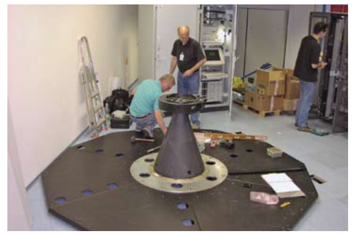
REASSEMBLING THE MASS STORAGE SYSTEM

With these technologically advanced security measures, the centre is well equipped to fulfill the important computer security requirements of the Treaty. The centre has a visitors area which presents an overview of the verification regime and allows a peek into the construction phase and the current operations.