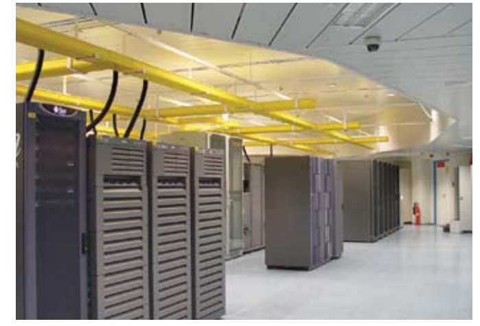
THE NEW COMPUTER CENTRE AT THE VIC, VIENNA, AUSTRIA