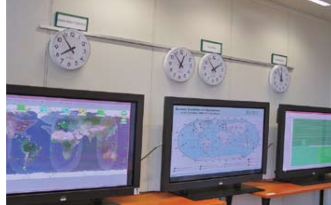
DISPLAY SCREENS AT THE PTS OPERATIONS CENTRE, VIENNA, AUSTRIA

The PTS is continuing to develop the unified tools and processes to record and track problems in the verification system and to monitor its state of health. An incident tracking tool supports a mechanism to open