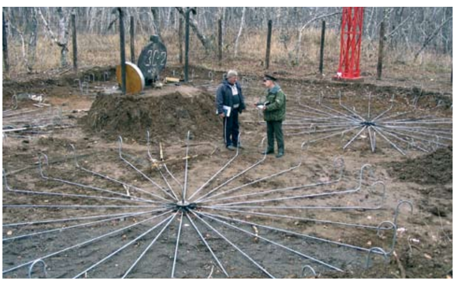
DISCUSSION OF INSTALLATION LOGISTICS AT IS44, KAMCHATKA, RUSSIAN FEDERATION

activities were particularly challenging due to the harsh environment and the short summer, the only time of the year when such work could be carried out.