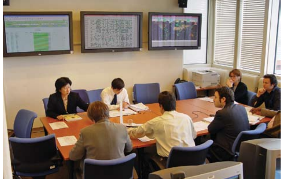
ROUND TABLE MEETING AT THE PTS OPERATIONS CENTRE, VIENNA, AUSTRIA

In performing the above tasks, various Divisions of the PTS collaborate to achieve the goals set for the PTS. Further, many of the actors are external to the PTS, such as station operators (designated by the host States), other State institutions as well as contractors to the PTS. The work of all of these actors needs to be successfully coordinated in order to produce optimum results.