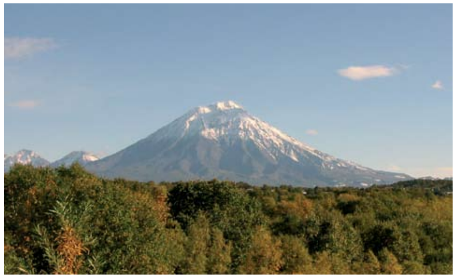
ON THE WAY TO THE INSTALLATION SITE OF IS44 AND PS36, KAMCHATKA, RUSSIAN FEDERATION

Even as the IMS network reaches completion, much work remains to be done. The Provisional Technical Secretariat (PTS) is moving from a development stage to a mature operational and maintenance stage. By the end of 2007, the PTS expects that approximately 90 per cent of the IMS network will be completed and sending data to Vienna.