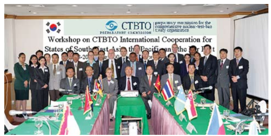
PARTICIPANTS AT THE REGIONAL WORKSHOP ON CTBTO INTERNATIONAL COOPERATION, SEOUL, REPUBLIC OF KOREA, 18-20 OCTOBER 2005

for the States of South East Asia, the Pacific and the Far East, in Seoul, Republic of Korea. Both workshops were well attended. The discussions focused on promoting regional security by adhering to the Treaty, prospects of its ratification in the respective regions, national implementation measures, progress in the installation of the International Monitoring System stations, technical cooperation among States and with other regions, and potential benefits deriving from civil and scientific applications of verification data.