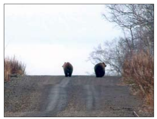
BEAR ENCOUNTER ON THE ROAD TO INSTALLATION SITE

population was left to flourish: The peninsula contains great species diversity, including the world's largest variety of salmon and the densest population of brown bears in the world. The bears, which reach an enormous size of up to three meters in length and 1000 kg in weight, live all over the peninsula.