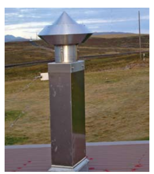
AIR INLET OF AUTOMATIC RADIONUCLIDE STATION, RN34, REYKJAVIK, ICELAND

Within the framework of that agreement, several key activities have been implemented or are being pursued which have benefited or would benefit from civil and scientific applications of International Monitoring System (IMS) data and from methodologies, technical advice and