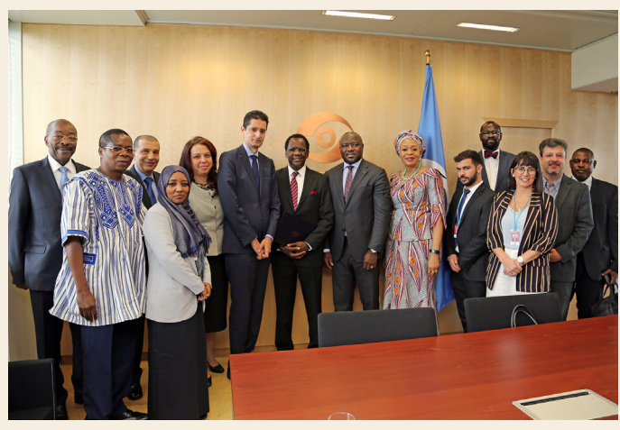
AFRICA GROUP MEETING WITH CTBTO EXECUTIVE SECRETARY LASSINA ZERBO HELD ON 22 JUNE 2018 IN VIENNA.

'... As we prepare for the 19th anniversary of the adoption of the CTBT, the African Group stresses the importance of achieving universal adherence to this instrument, bearing in mind the special responsibilities of nuclear-weapon States in this regard and to encourage the remaining Annex 2 States, in particular nuclear-weapon States to sign and ratify the CTBT without further delay, in order to allow its entry into force. The achievement of such an objective will contribute to the process of nuclear disarmament and in bringing us to a significant step of realizing the objective of NPT."