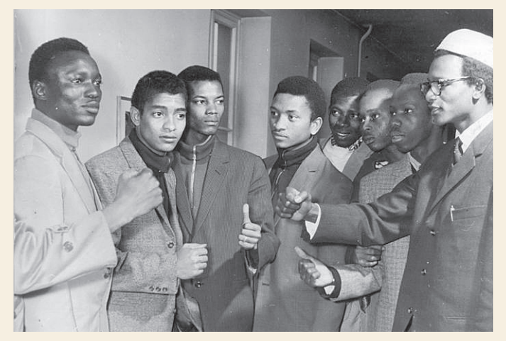
STUDENTS FROM MALI IN LEIPZIG, THEN EAST GERMANY, PROTESTING AGAINST THE FIRST FRENCH NUCLEAR TEST ON 13 FEBRUARY 1960.

weapon-free world. This commitment was re-affirmed by the African Nuclear-Weapon-Free Zone Treaty (Pelindaba Treaty) when it opened for signature in 1996. The creation of the African Union in July 2002 further strengthened Africa's commitment to regional and international peace and stability. African leaders recognized that security is a prerequisite for sustainable economic development and human welfare.