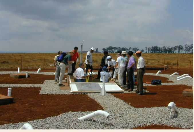
INFRASOUND STATION IS33 IN ANTANANARIVO, MADAGASCAR.