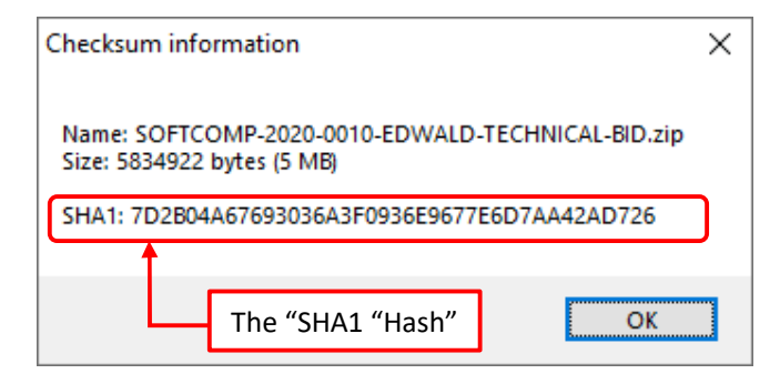
Figure 3 SHA1

If this CRC SHA function is not available by 'right-click' on your Windows version, you can also do this from 'the command line', a slightly more complicated way. Open a CMD window (see sidebar below), move to the folder where your archive is, and execute the command: